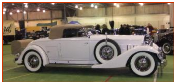
1933 Packard 12 - Classic Car Museum,