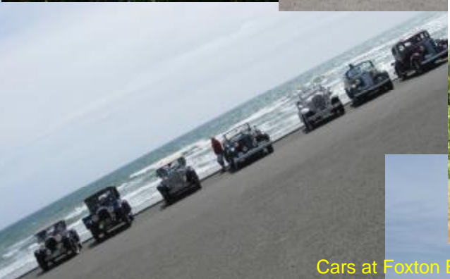
Cars at Foxton Beach