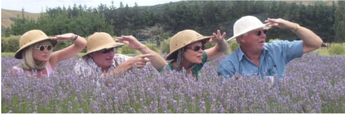
Arrival of our South Island friends