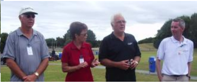
The 4 colours of Packard shirts—see later for details to order