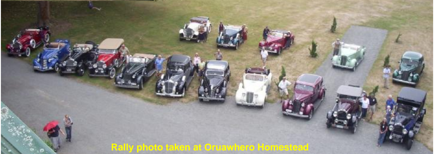
Rally photo taken at Oruawhero Homestead