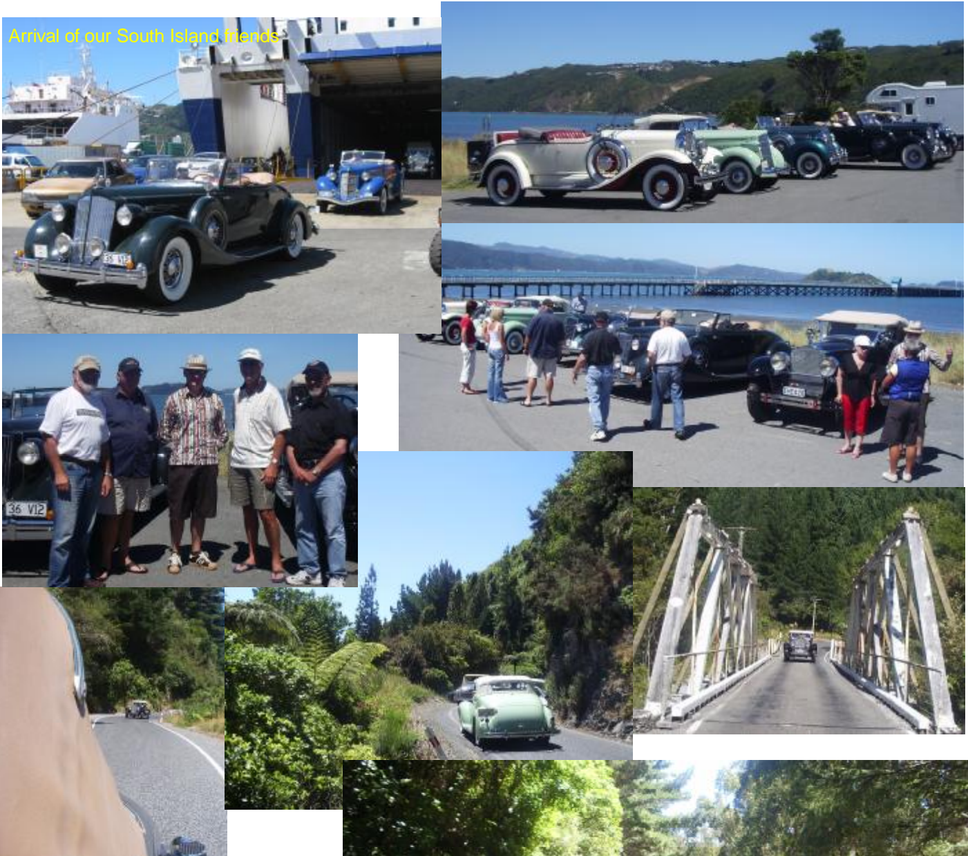
After meeting the South Islanders in Wellington, 5 cars journeyed through the Akatarawa Gorge between Upper Hutt and Waikanae