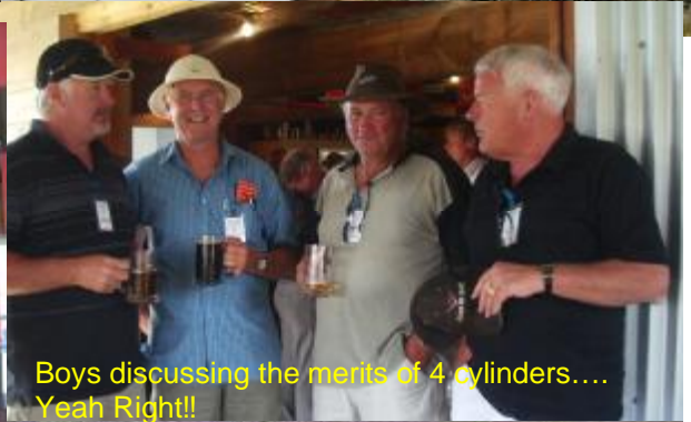
Boys discussing the merits of 4 cylinders.... Yeah Right!!