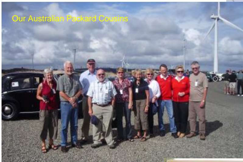
Our Australian Packard Cousins