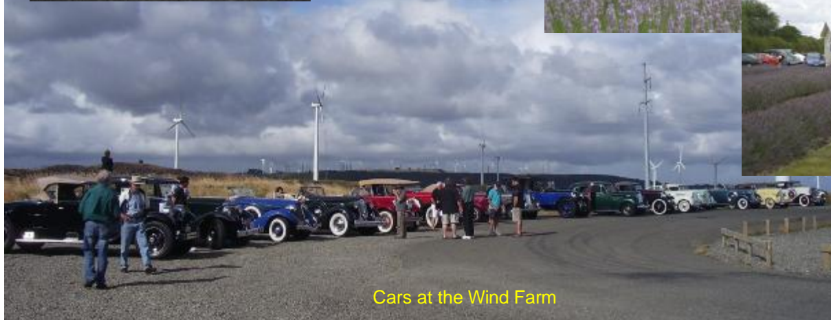
Cars at the Wind Farm