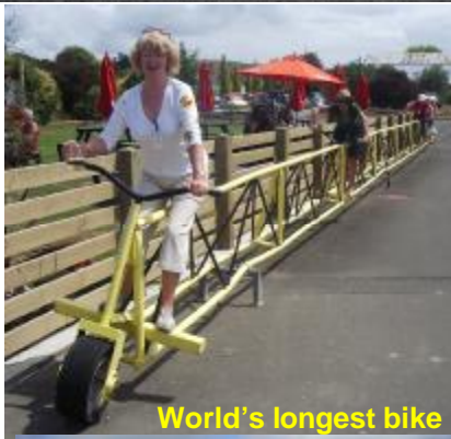
World's longest bike